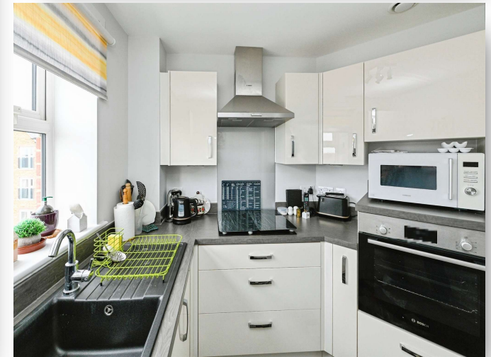
Eastland Grange, Valentine Road, Hunstanton, PE36 5FA