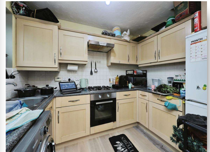
Geneva Walk, Toftwood, Dereham, NR19 1XT