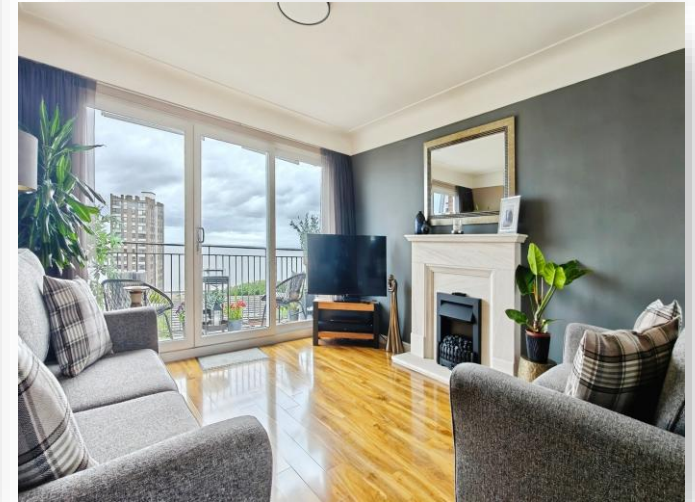
Redstone Park, Wallasey, CH45 9NB