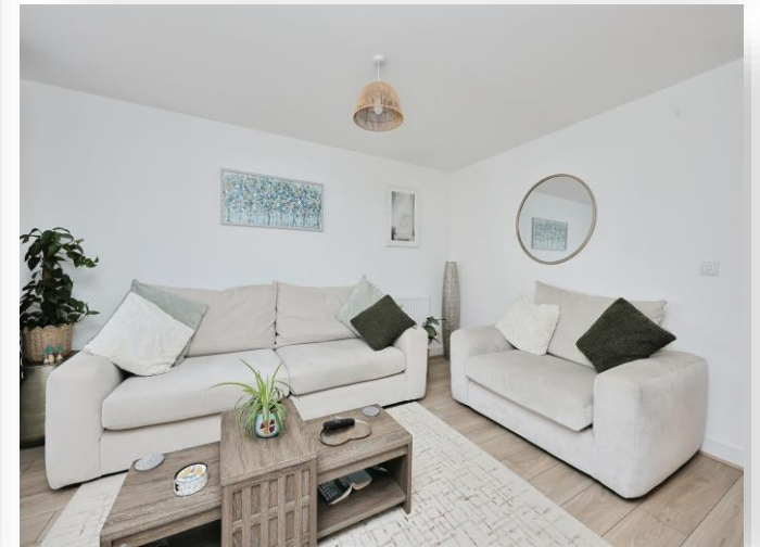
Turner Crescent, Postwick, Norwich, NR13 5GS