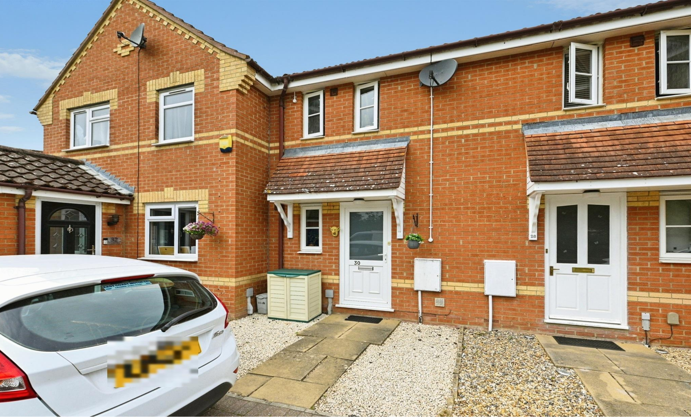
Weedon Way, KING'S LYNN, PE30 4YY