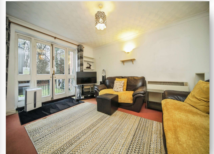
Gipping Place, Stowmarket, IP14 1JW