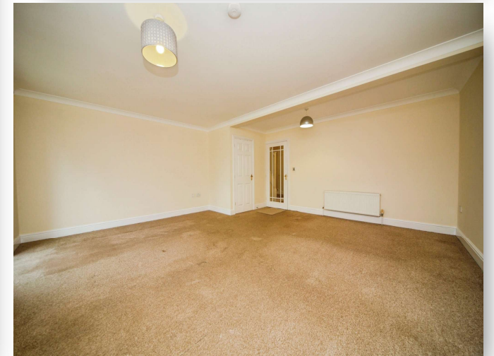
Poplar Hill, Stowmarket, IP14 2AS