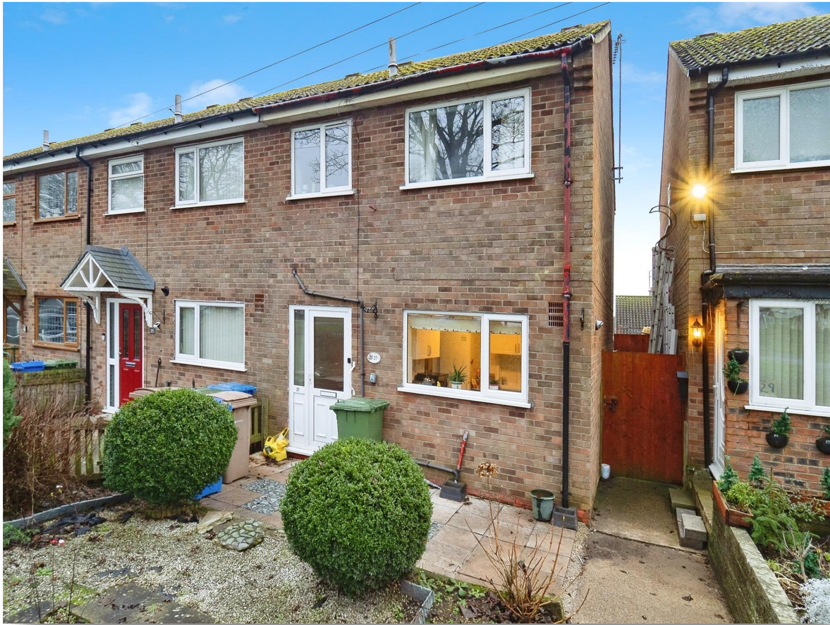
Easton Road, BRIDLINGTON, YO16 4BE