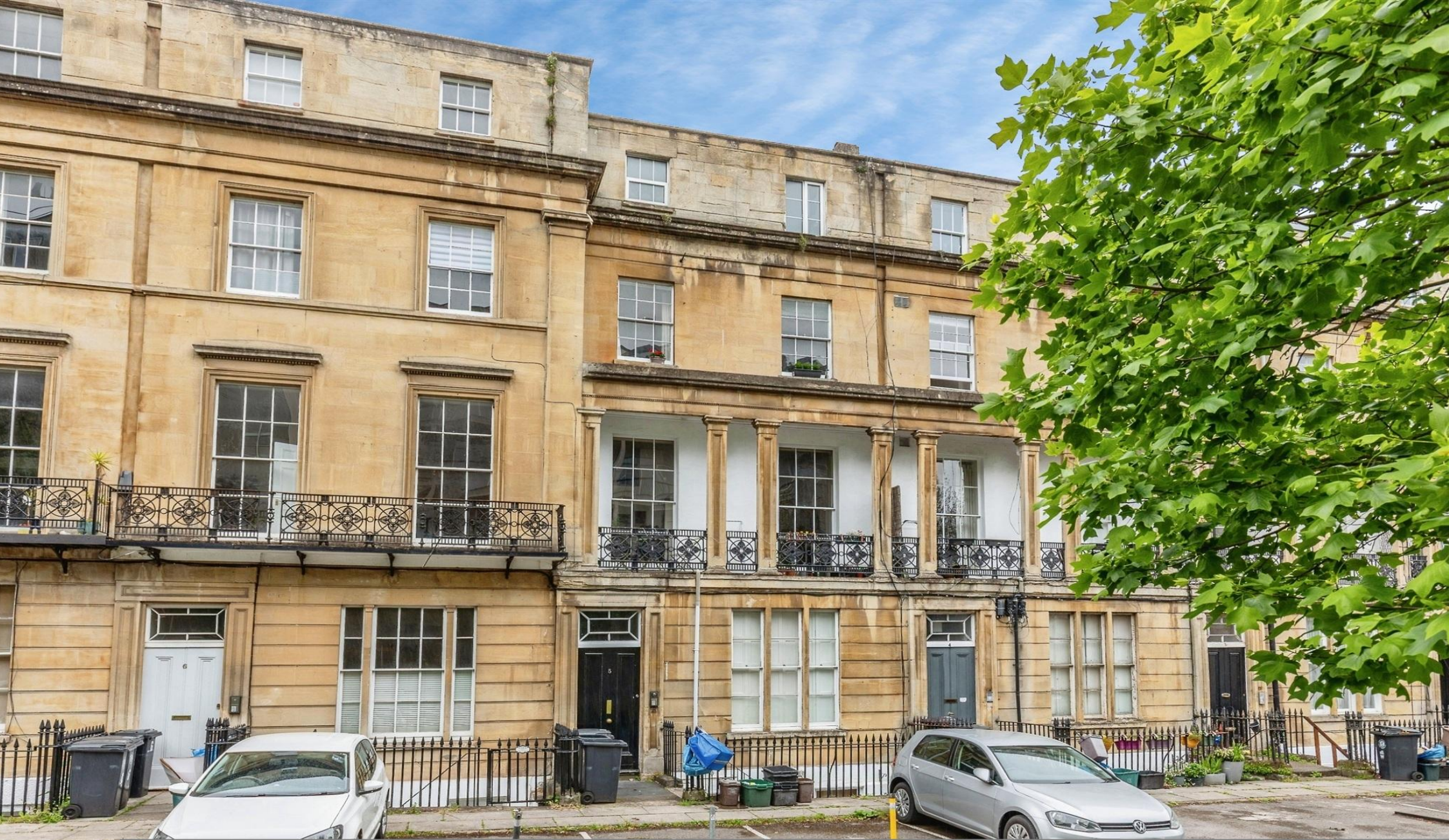
Buckingham Place, Clifton Bristol BS8 1LH