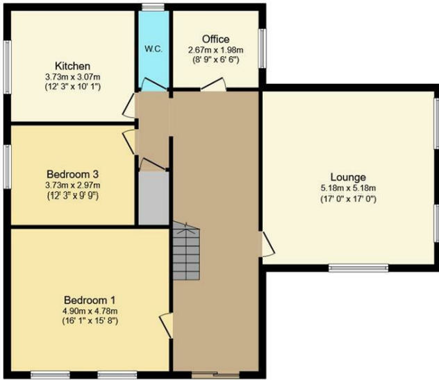
First Floor Floor area 108.2 sq.m. (1,165 sq.ft.) approx