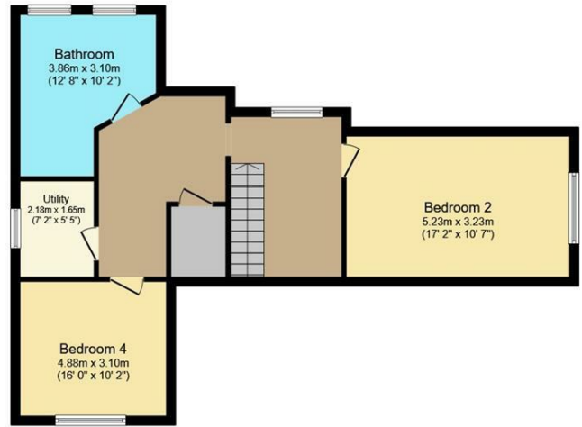
Second Floor Floor area 63.7 sq.m. (686 sq.ft.) approx

Total floor area 171.9 sq.m. (1,850 sq.ft.) approx