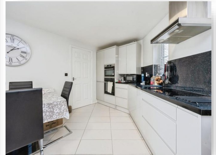
Cooper Drive, Leighton Buzzard, LU7 4RZ