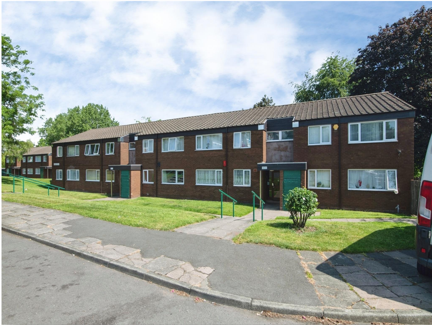
Lakeside Walk, Birmingham B23 7YP