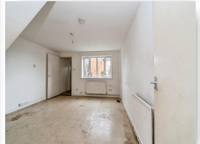
Mayfield Close, Kempston, Bedford, MK42 8UP