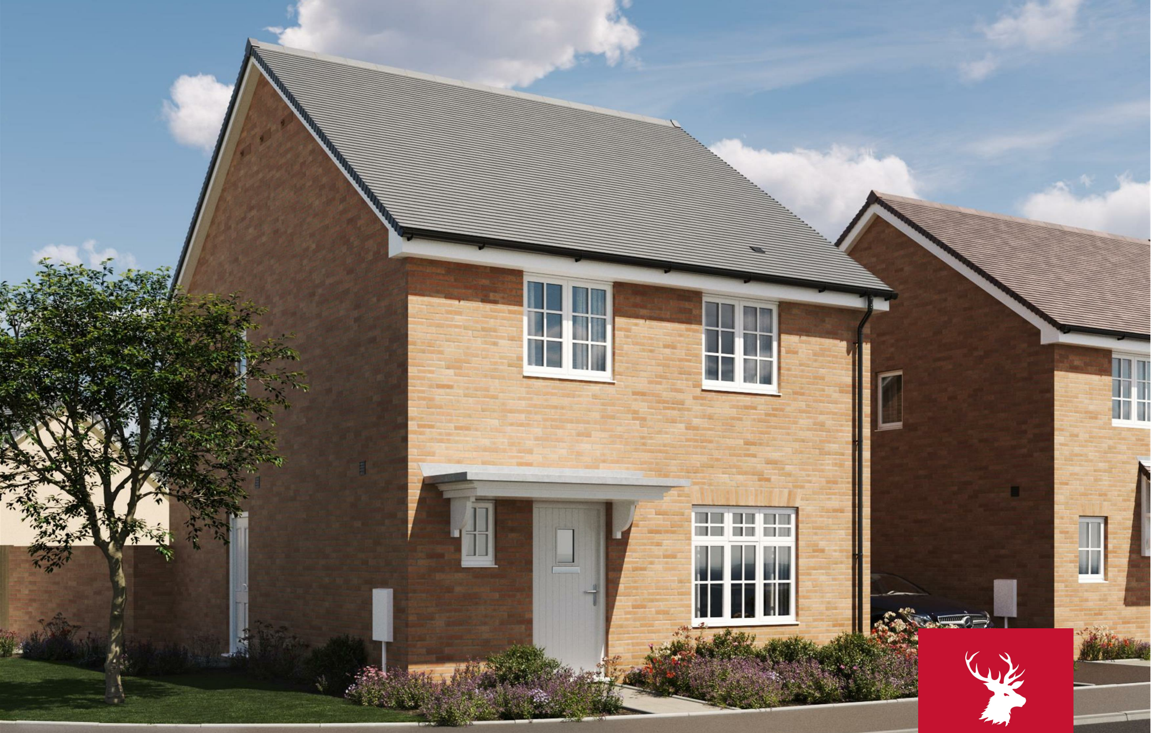
Plot 6 - The Ramsey