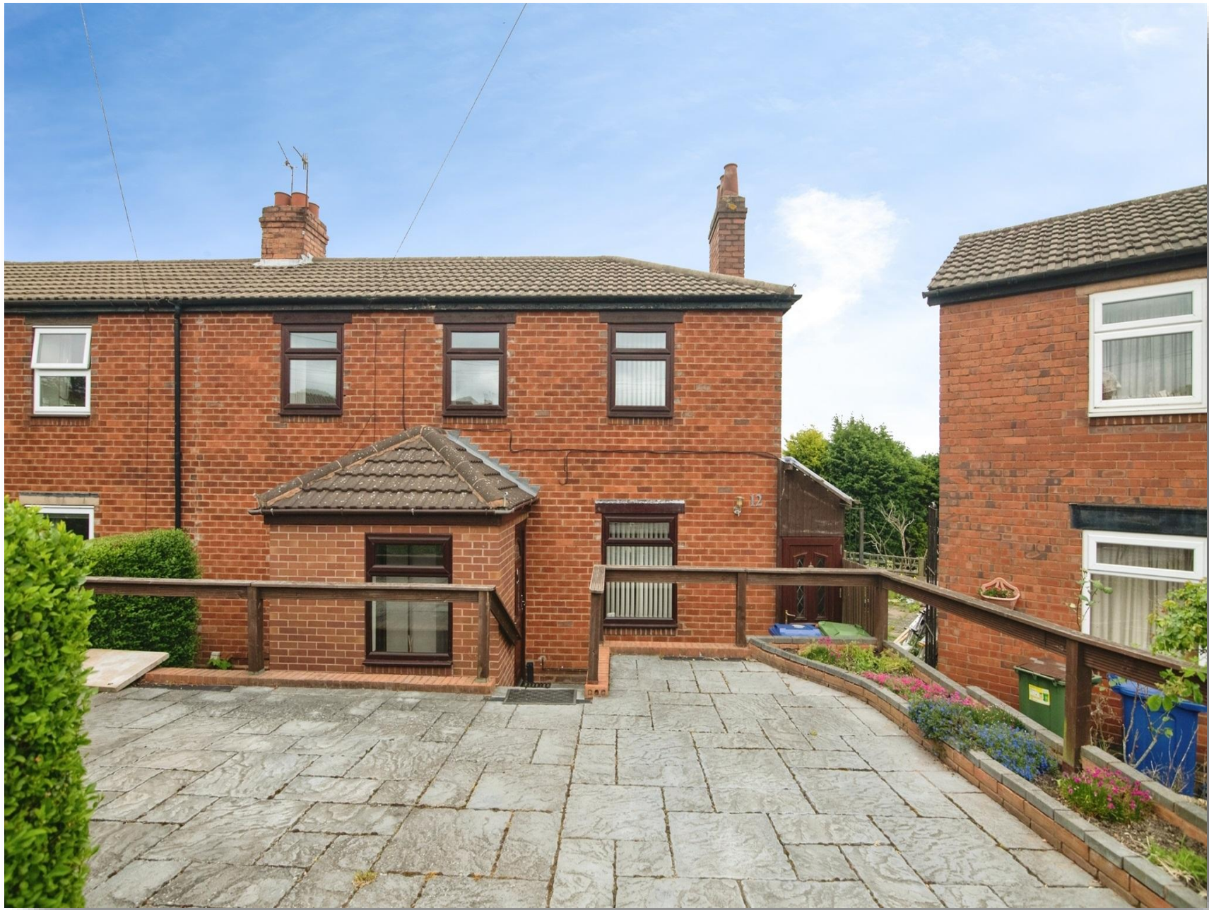
White City Road, Brierley Hill DY5 1AA