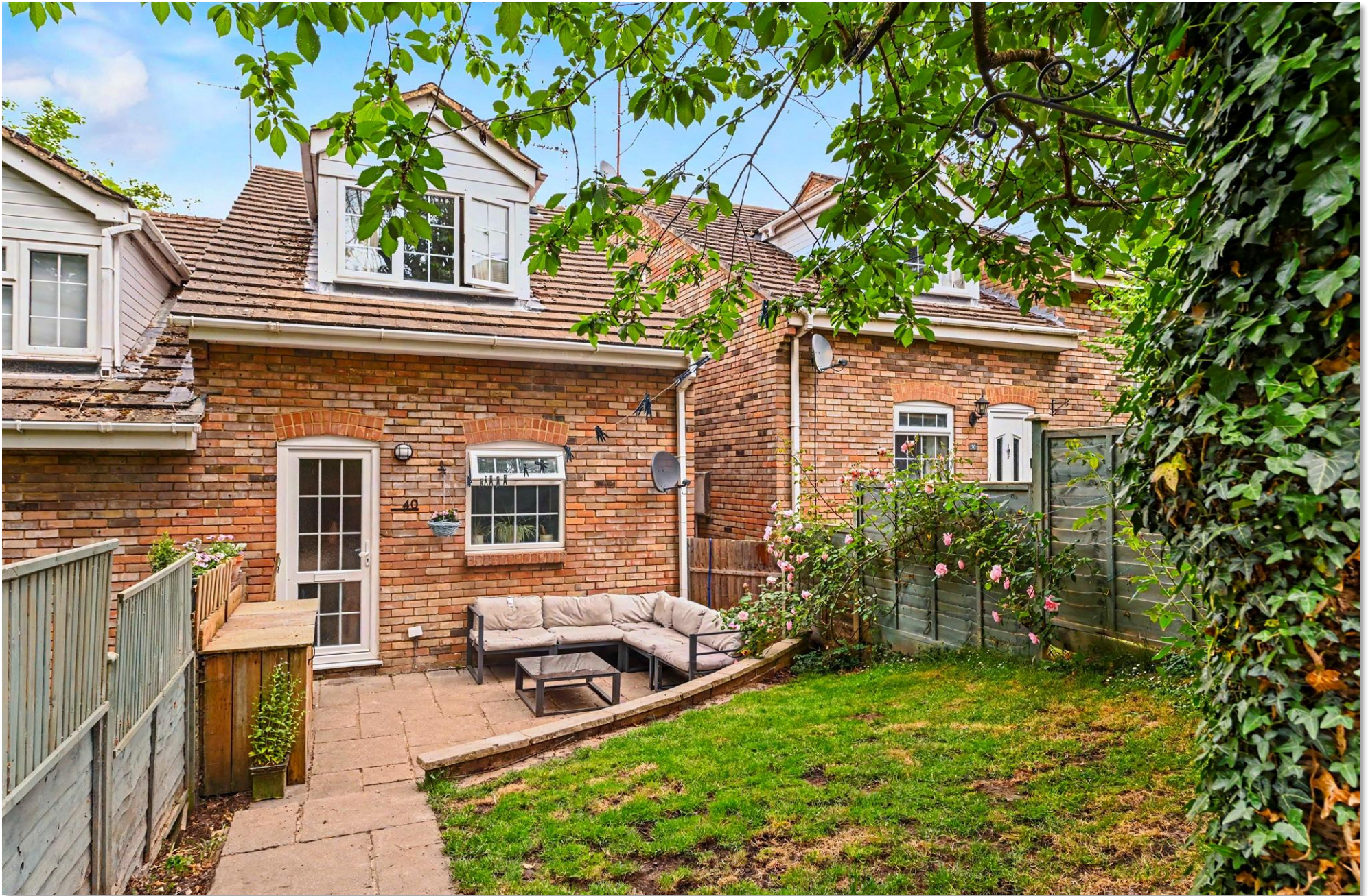
Grove Gardens, Tring HP23 5PX