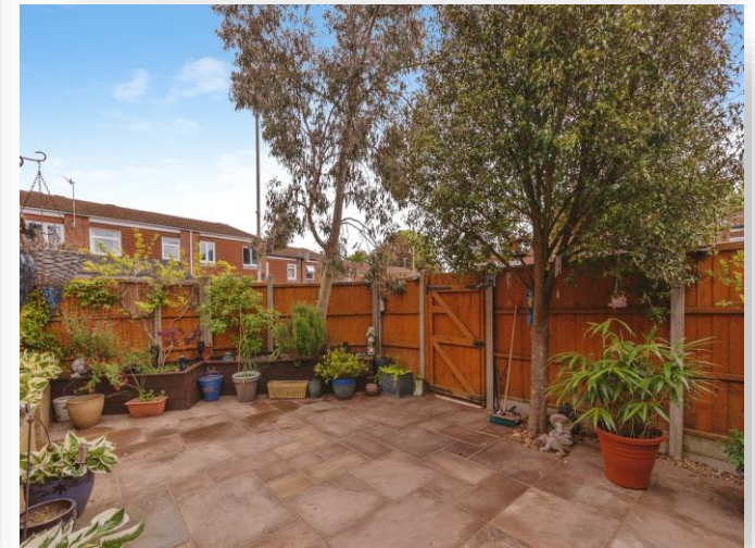
Crookhorn Lane, Waterlooville PO7 5XH