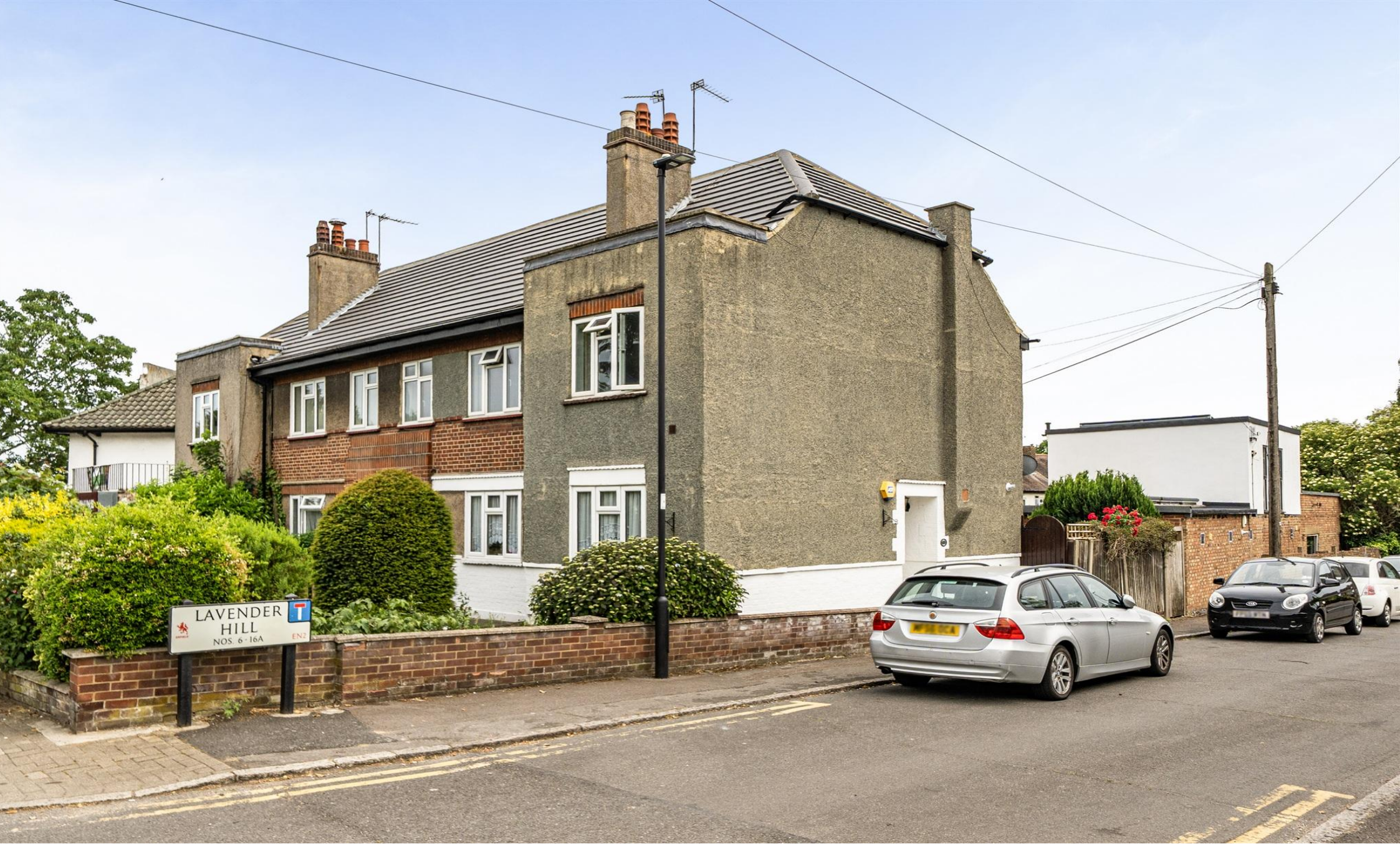
Lavender Hill, Enfield, EN2 0RE