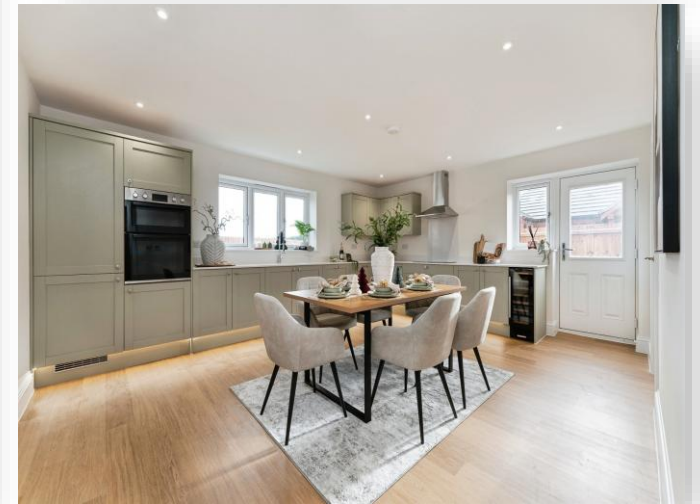
Rose Gardens, Manea PE15 0WX