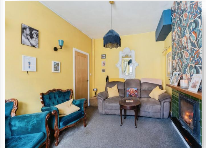
Woodchurch Road, Birkenhead, CH42 9LQ