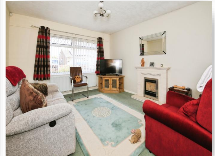
Churchfield Way, Whittlesey Peterborough PE7 1JY