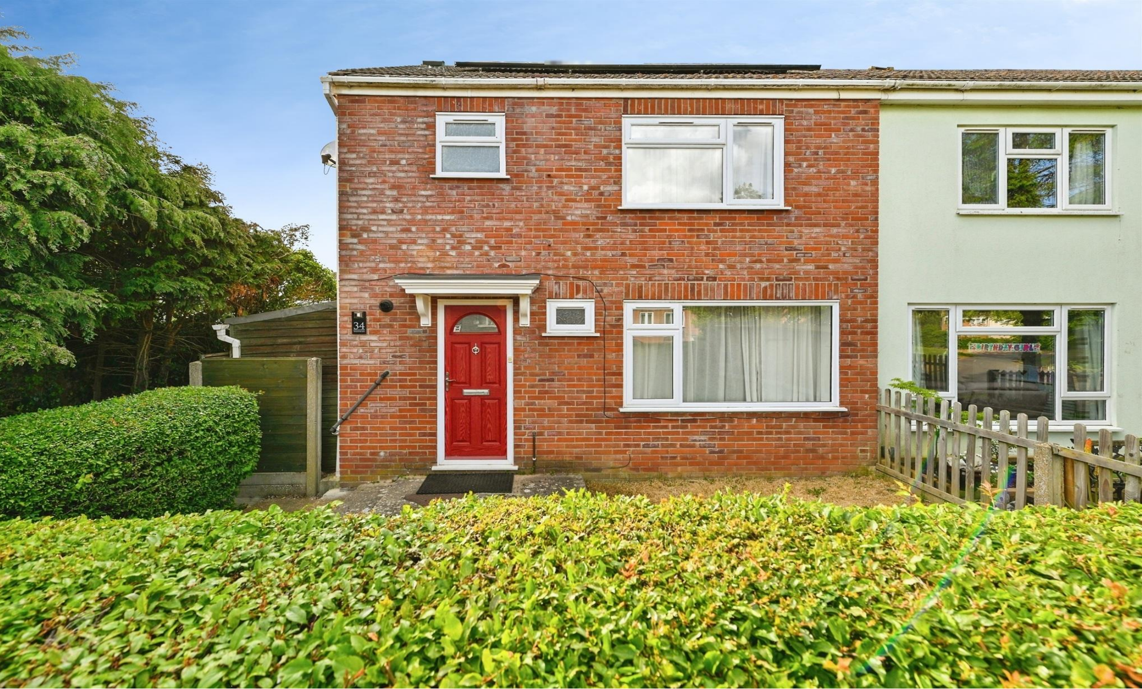
Westfields, King's Lynn, PE30 4SB