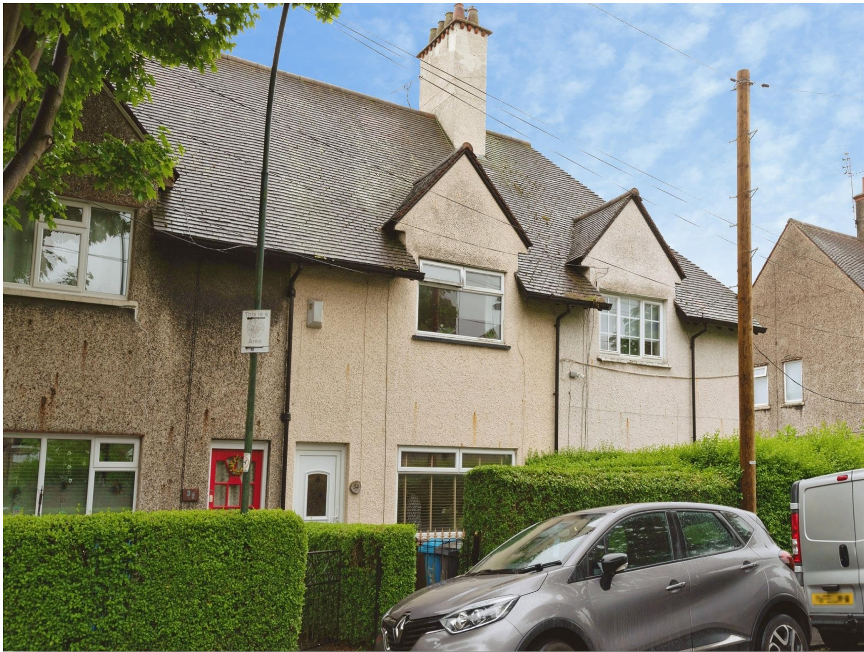
Chestnut Grove, Garden Village, Hull, HU8 8QL