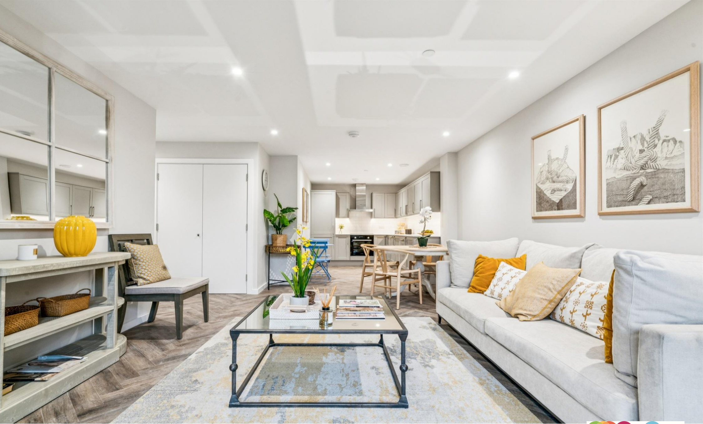
Meadow House, Fallsbrook Road, London SW16 6DY