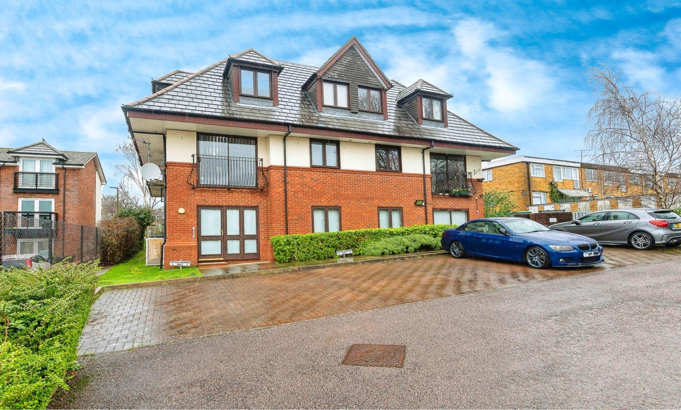
Davidson House Queensway,HEMEL HEMPSTEAD HP2 5FX