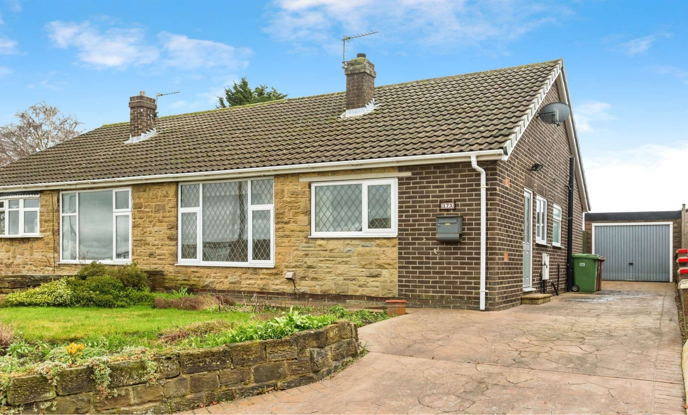
Netherton Lane, Netherton Wakefield WF4 4HL