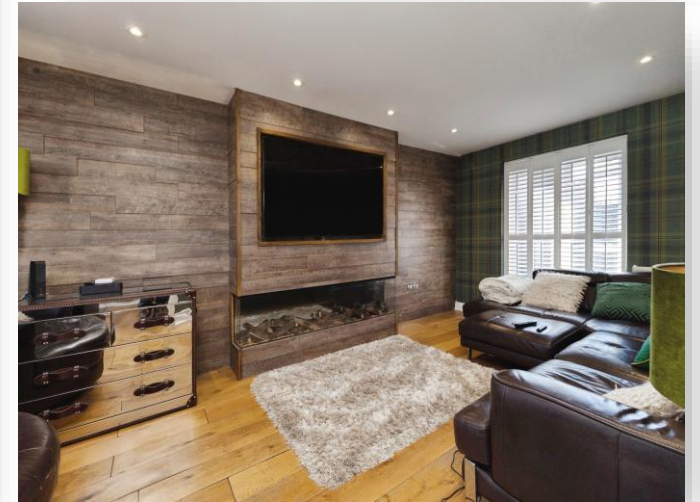
Maddren Way, Middlesbrough TS5 5BD