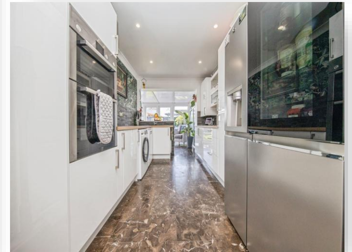
Dawnbrook Close, Ipswich, IP2 9JW