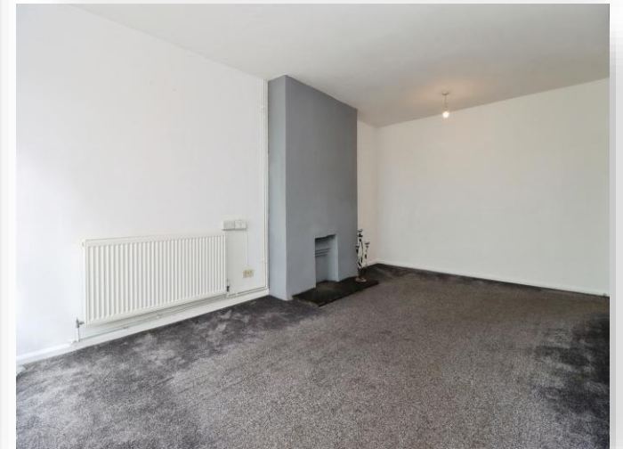
Scott Road, Wellingborough NN8 3DJ