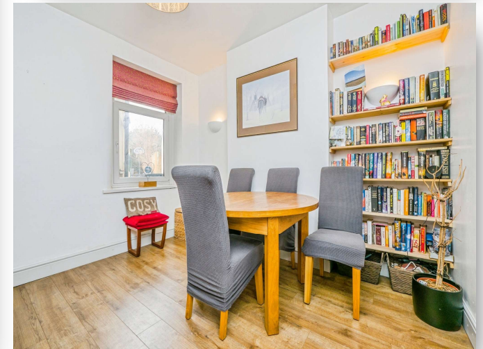
Pearl Street, Splott Cardiff CF24 1PL