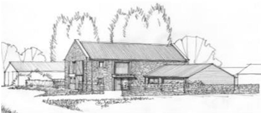
Proposed north perspective view