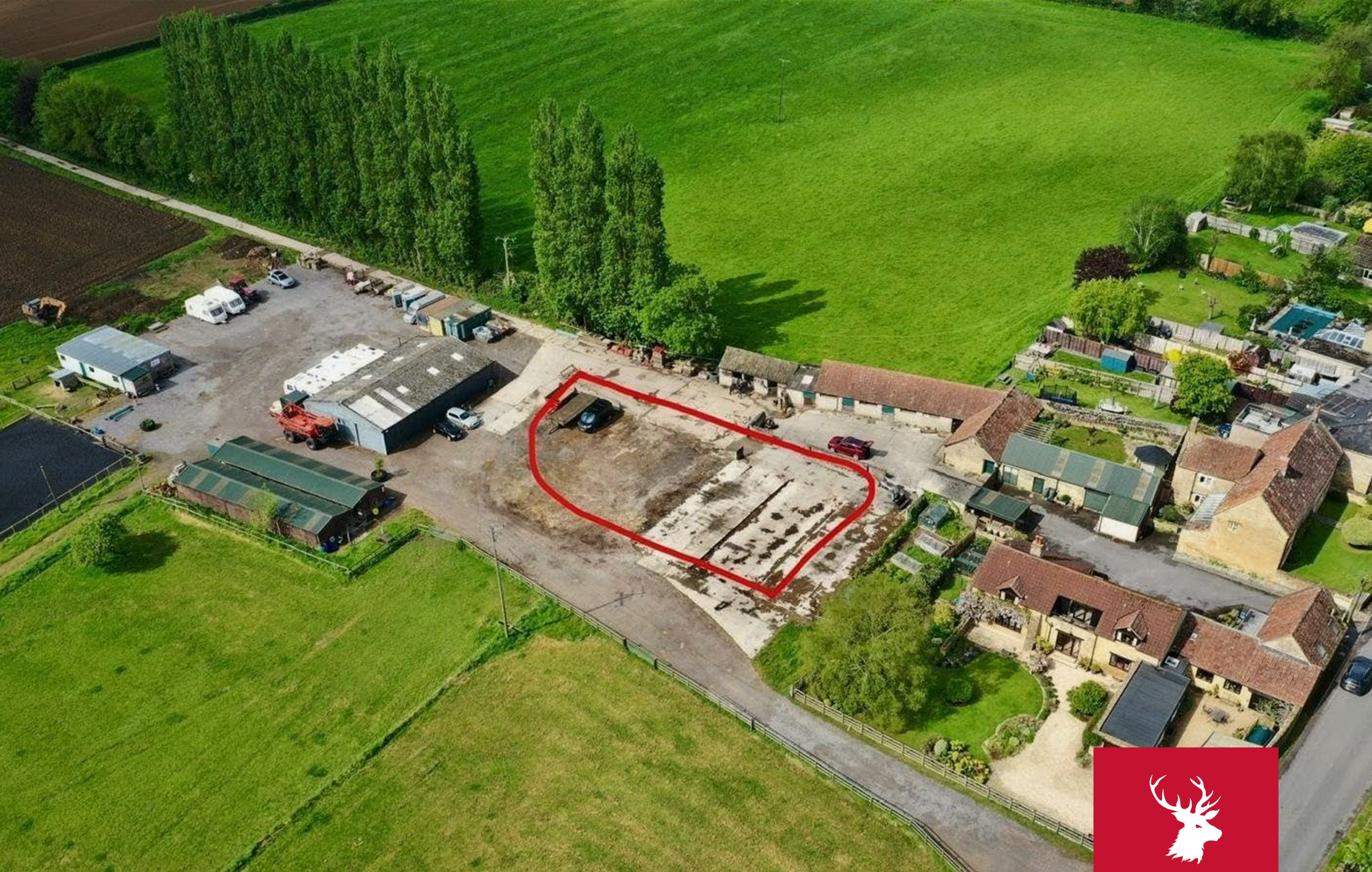
Building Plot at Spring Farm