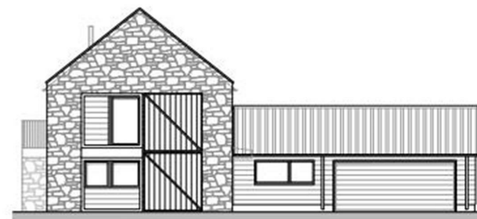
(B) Proposed east elevation