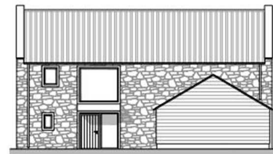
(D) Proposed north elevation