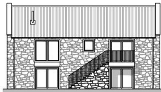
(A) Proposed south elevation

The marked red boundary lines on the aerial photographs are for identification purposes only.