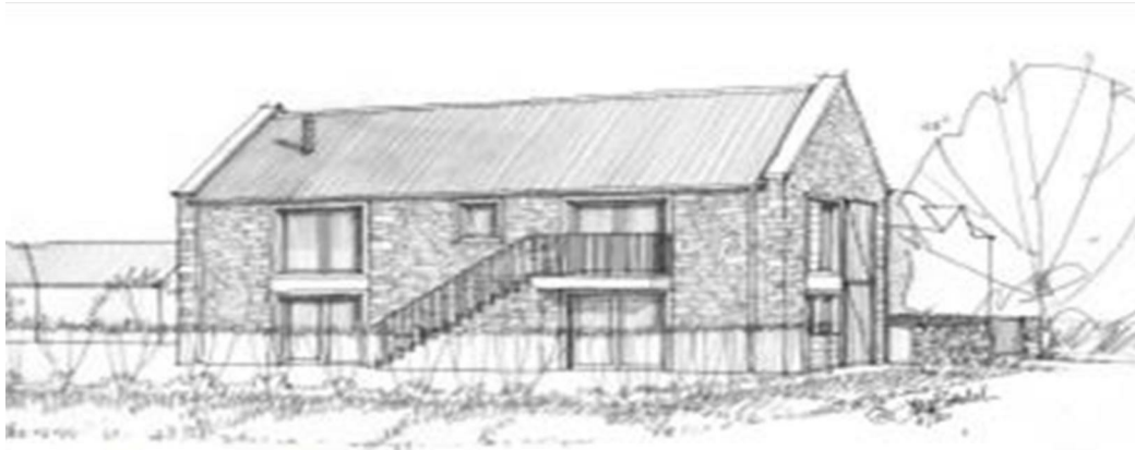
Proposed south perspective view

IMPORTANT: Stags gives notice that: 1. These particulars are a general guide to the description of the property and are not to be relied upon for any purpose. 2. These particulars do not constitute part of an offer or contract. 3. We have not carried out a structural survey and the services, appliances and fittings have not been tested or assessed. Purchasers must satisfy themselves. 4. All photographs, measurements, floorplans and distances referred to are given as a guide only. 5. It should not be assumed that the property has all necessary planning, building regulation or other consents. 6. Whilst we have tried to describe the property as accurately as possible, if there is anything you have particular concerns over or sensitivities to, or would like further information about, please ask prior to arranging a viewing.