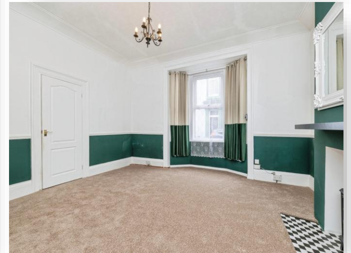
Catherine Street, Hartlepool, TS24 0QB