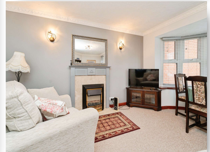
Bridge Street, Fakenham, NR21 9TE