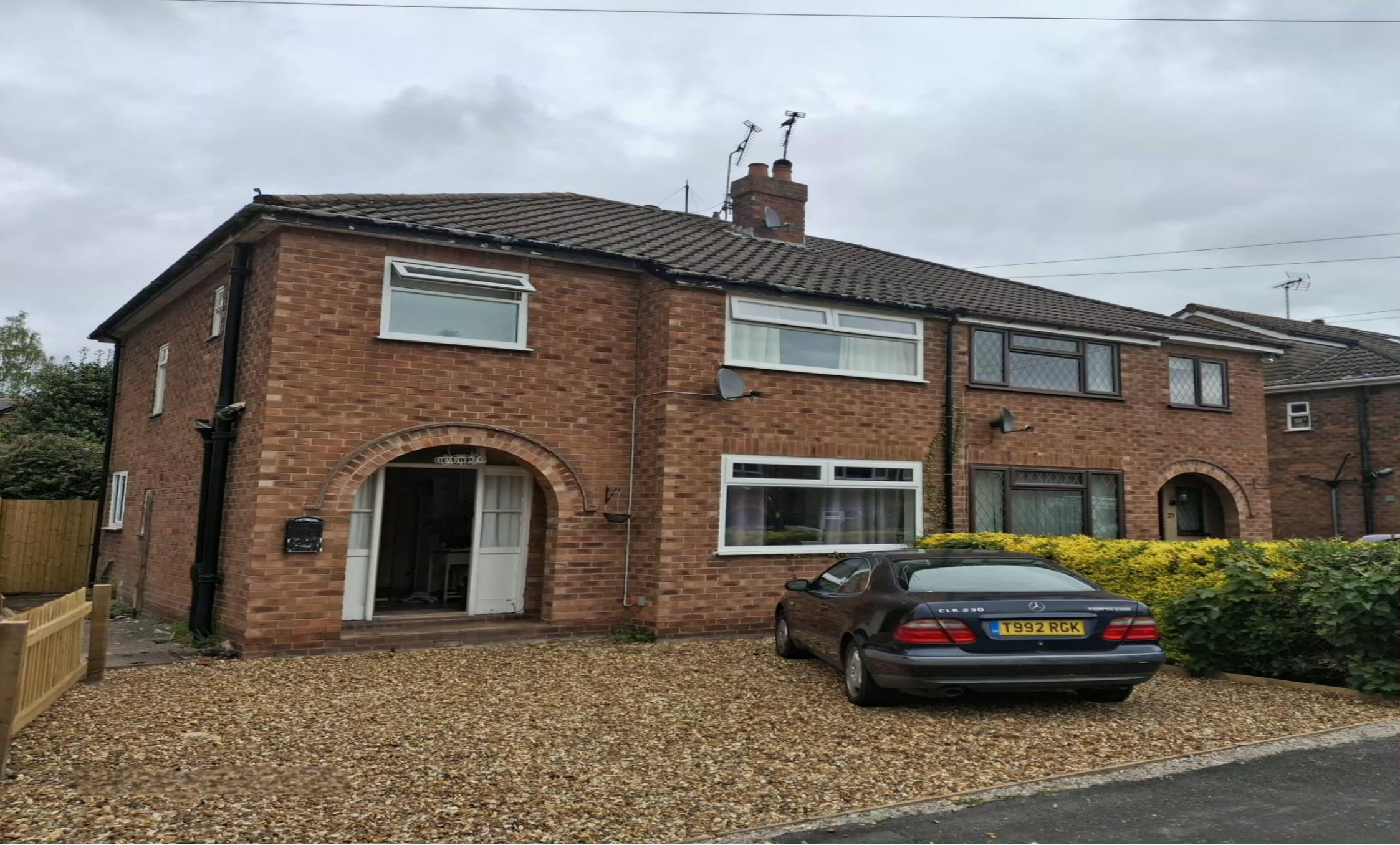
Hawthorn Road, Christleton Chester CH3 7BL