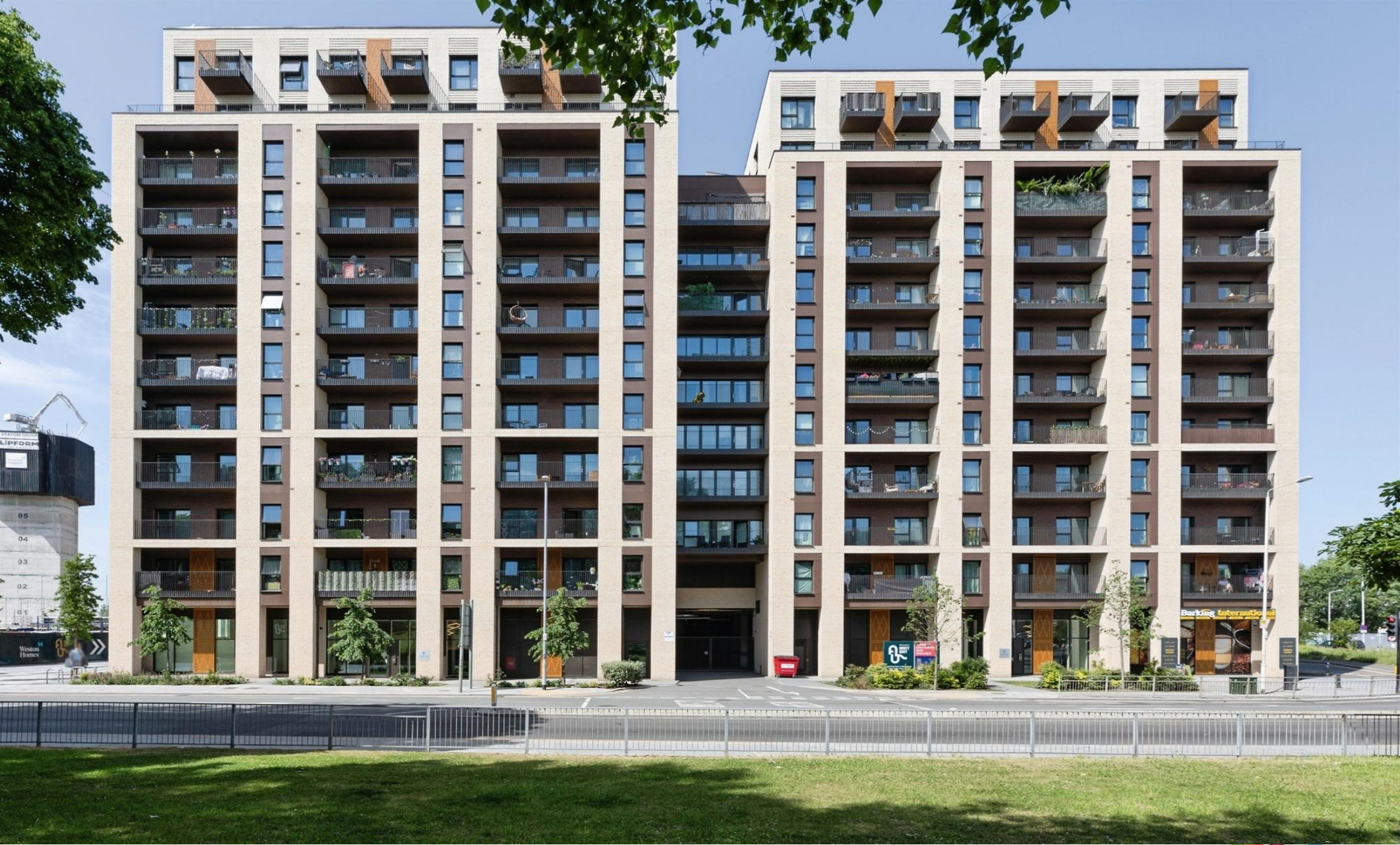
Erken Plaza, Abbey Road, Barking, IG11 7EP