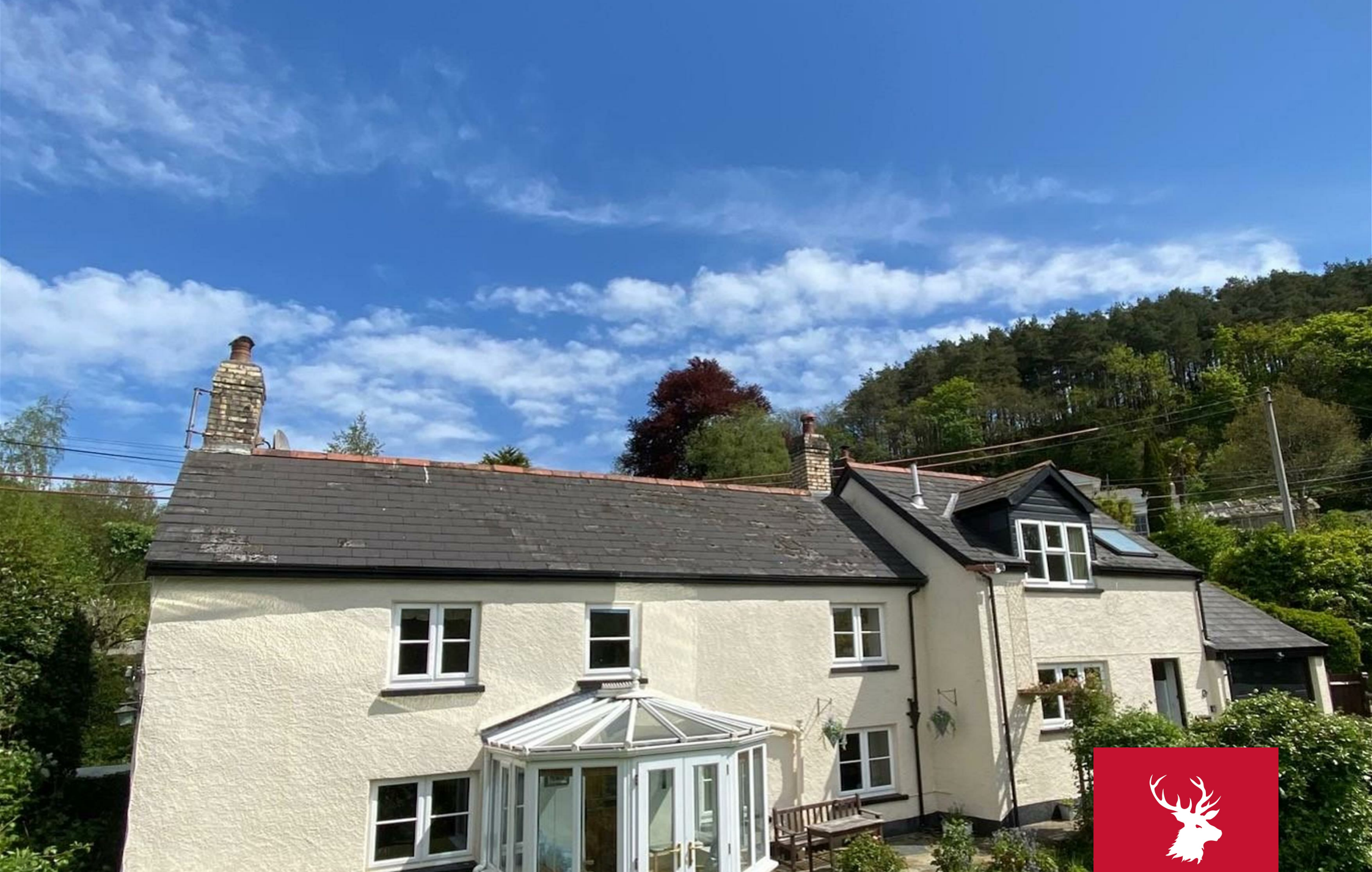
Burnards & Potential Building Plot