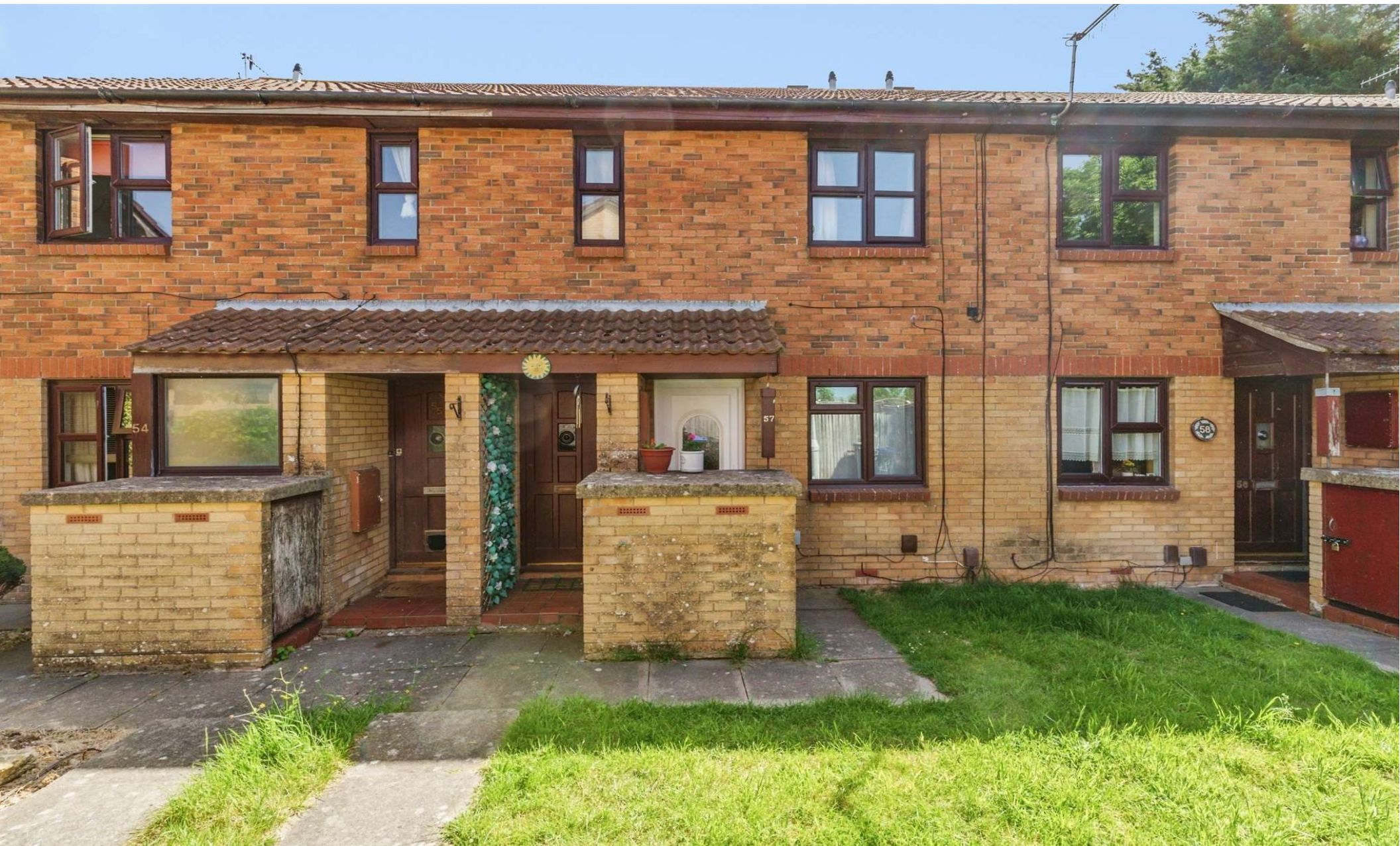
Pilgrims Walk, WORTHING BN13 1RJ