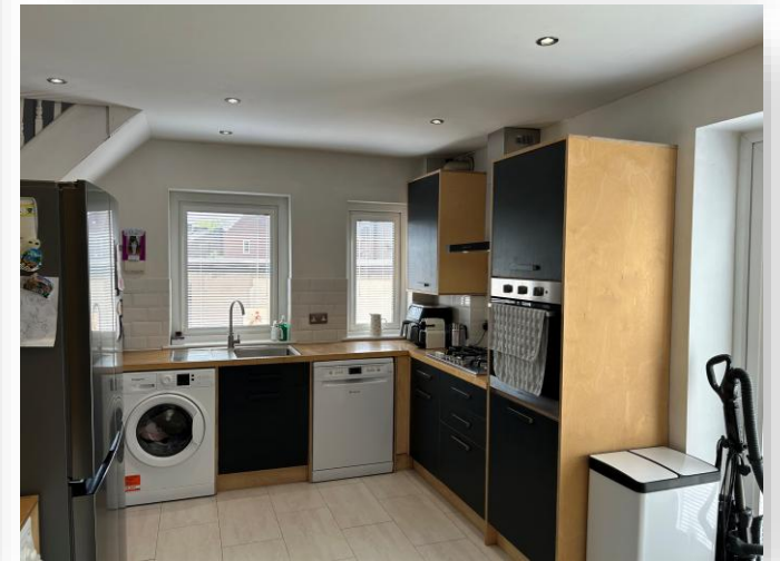
Elmfield Drive, Bradford BD6 1PS