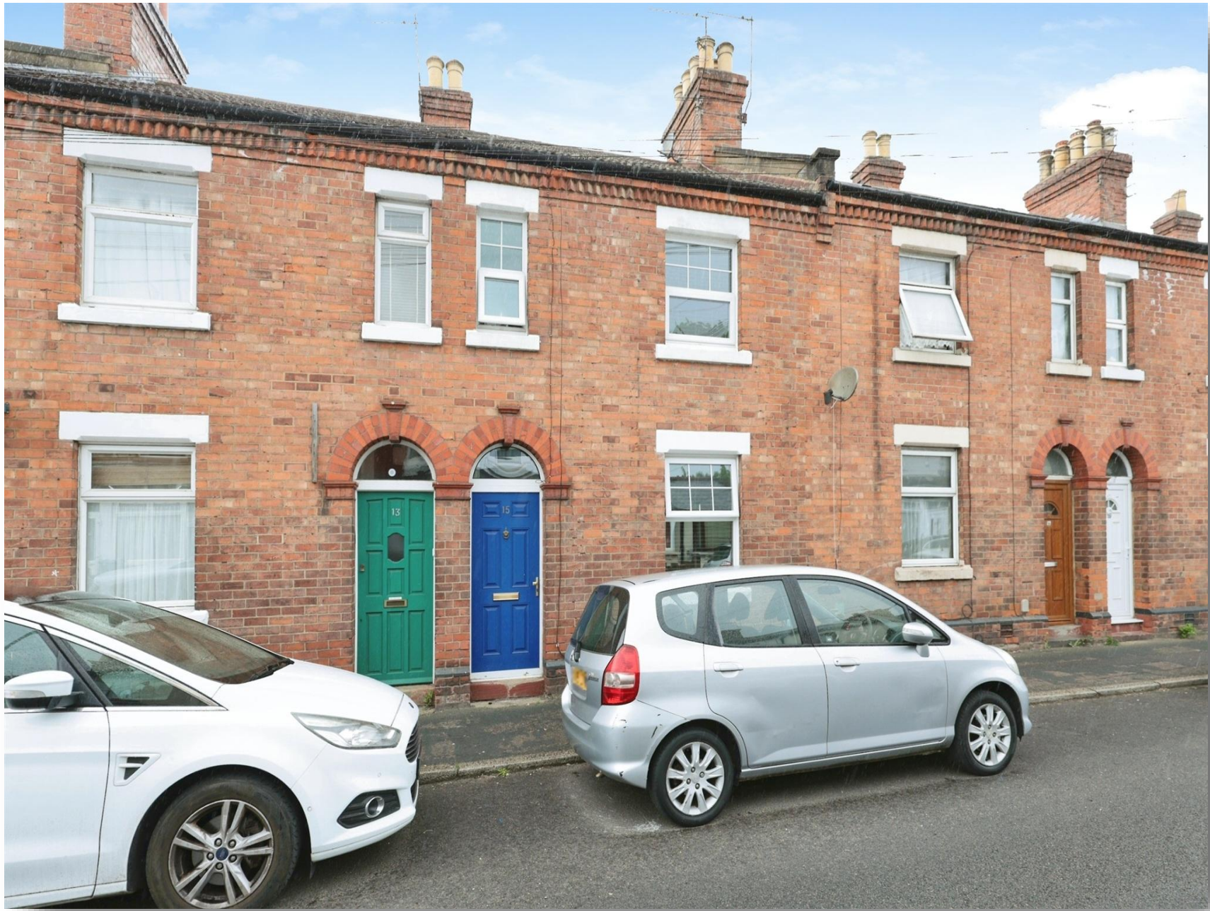
Leavesden Road, Watford, WD24 5EB