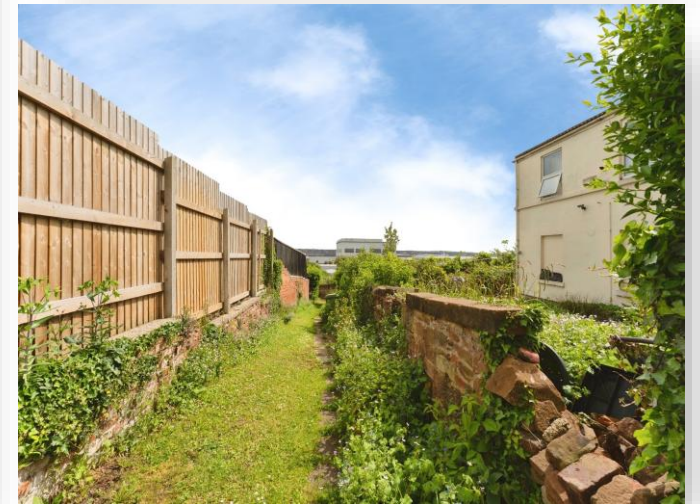
Fairview, Tranmere, Birkenhead, CH41 9EH