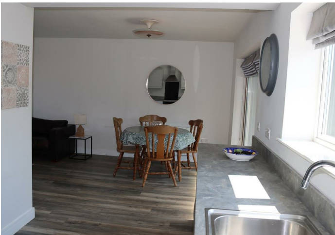
Open Plan Lounge/Dining/Kitchen