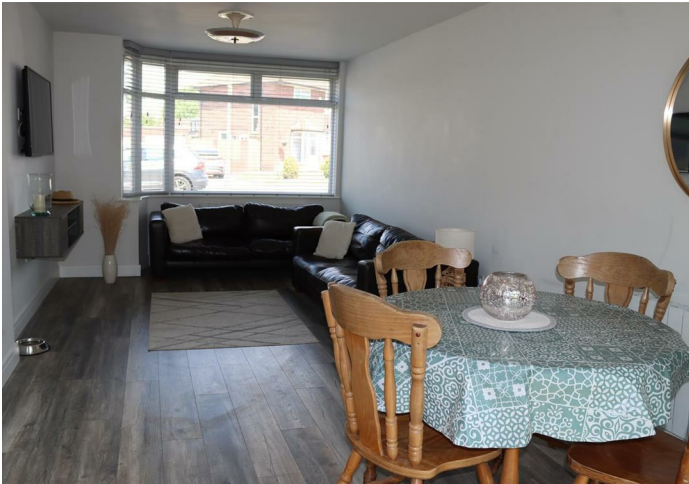
Open Plan Lounge/Dining/Kitchen