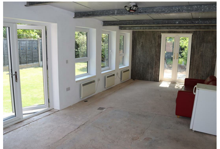
Extended Double Garage