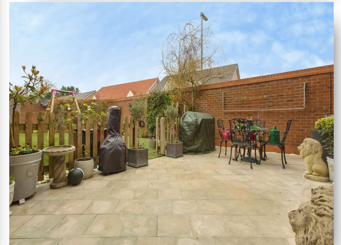
1 Wymund Way, Hauxton, Cambridge, CB22 5FQ