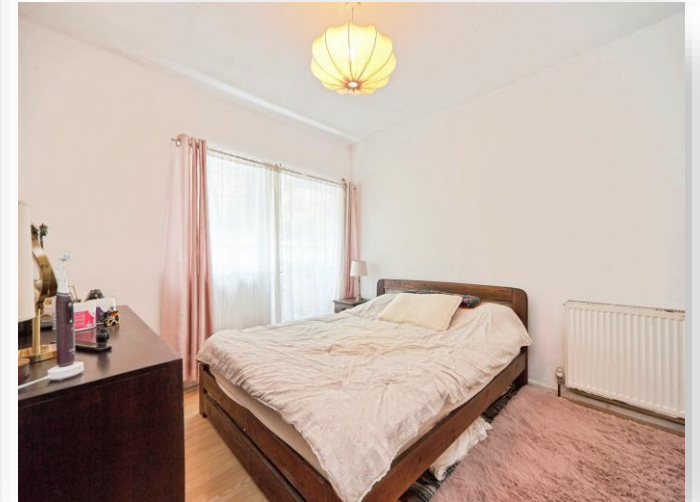
Grove Court, Leeds LS6 4AE