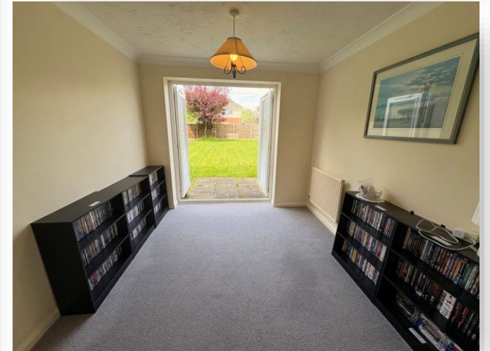
Clarence Drive, Coalville