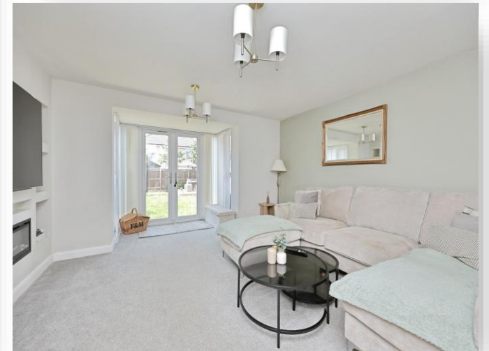
Metcalf Road, Rackheath, Norwich, NR13 6UE