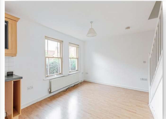
Chapman Road, Wellingborough NN8 1JN