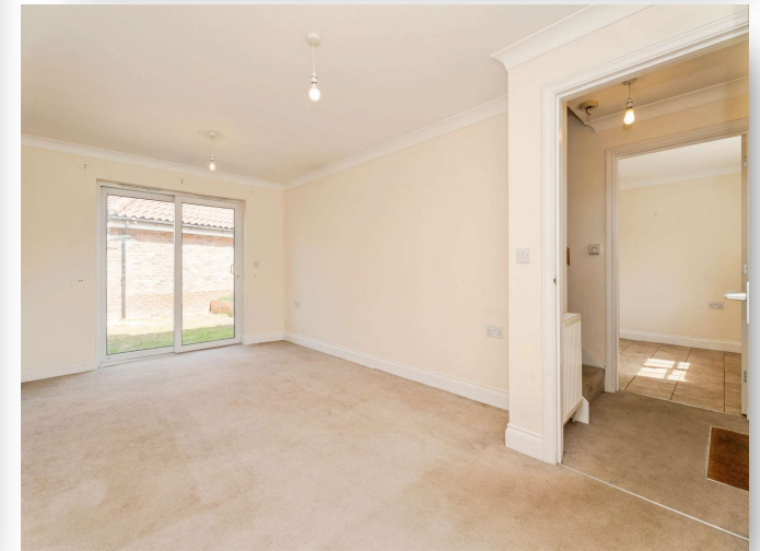
Baxter Close, FAKENHAM, NR21 8LE