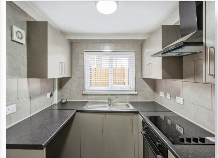
Church Street, Conisbrough Doncaster DN12 3JL