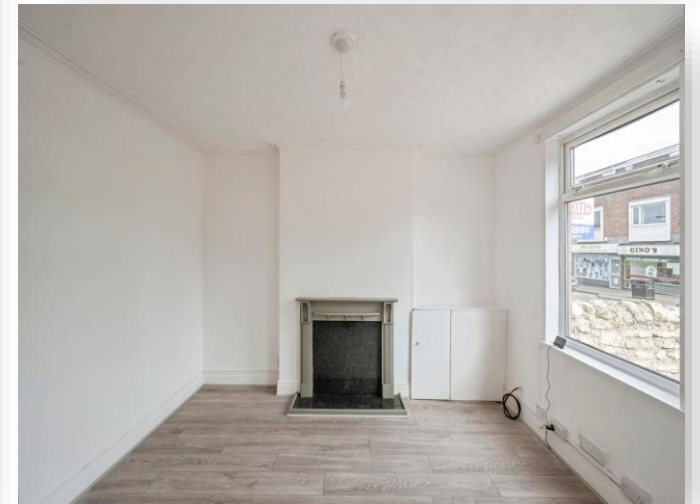
Church Street, Conisbrough Doncaster DN12 3JL