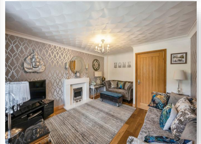
Cranwell Court, Goldthorpe Rotherham S63 9GA